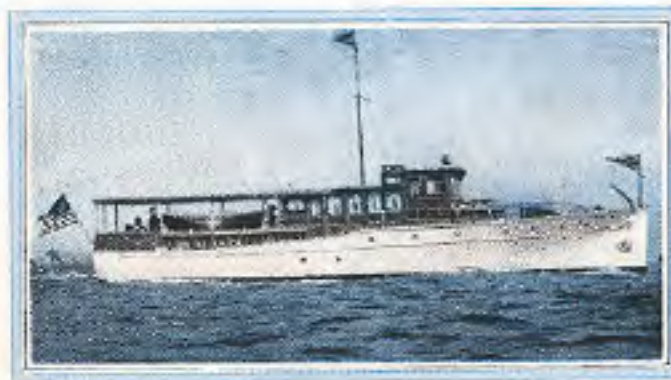
Elco Sixty-two Foot Motor Yacht

Y OU WILL probably be surprised to know that you can operate a $5,000 Elco Cruiser with living accommodations for a family of four or five, less expensively than it would cost to operate a $2,500 motor car. This estimate not only includes operating costs for three years, but also depreciation, insurance, upkeep, storage, and repairs. Elco standardized cruisers now range in size from the inexpensive 26 footer to the new 62 foot twin screw motor yacht, including the popular 34 foot, 42 foot and 50 foot models. This provides a boat to meet the needs . . . and purse . . . of every yachtsman. Prices range from $2,450 to $35,000—delivered at Bayonne, N. J.