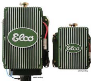
Elco's EP 7000 and EP 600 motors